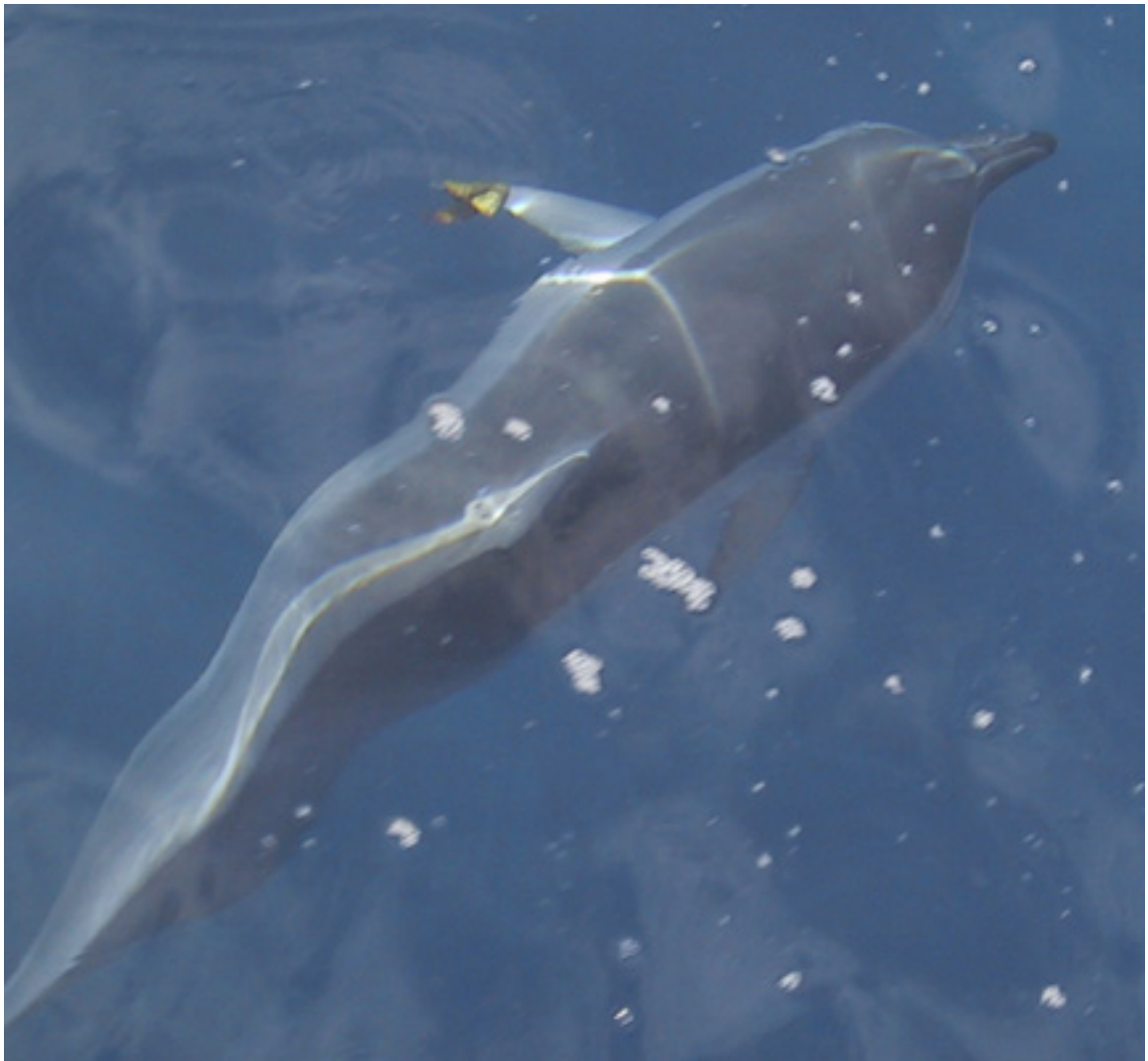
Dolphin playing with a leaf.